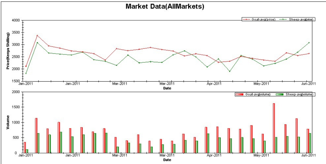
Figure 2: Price and volume trends for sheep and goats, January – June, 2011